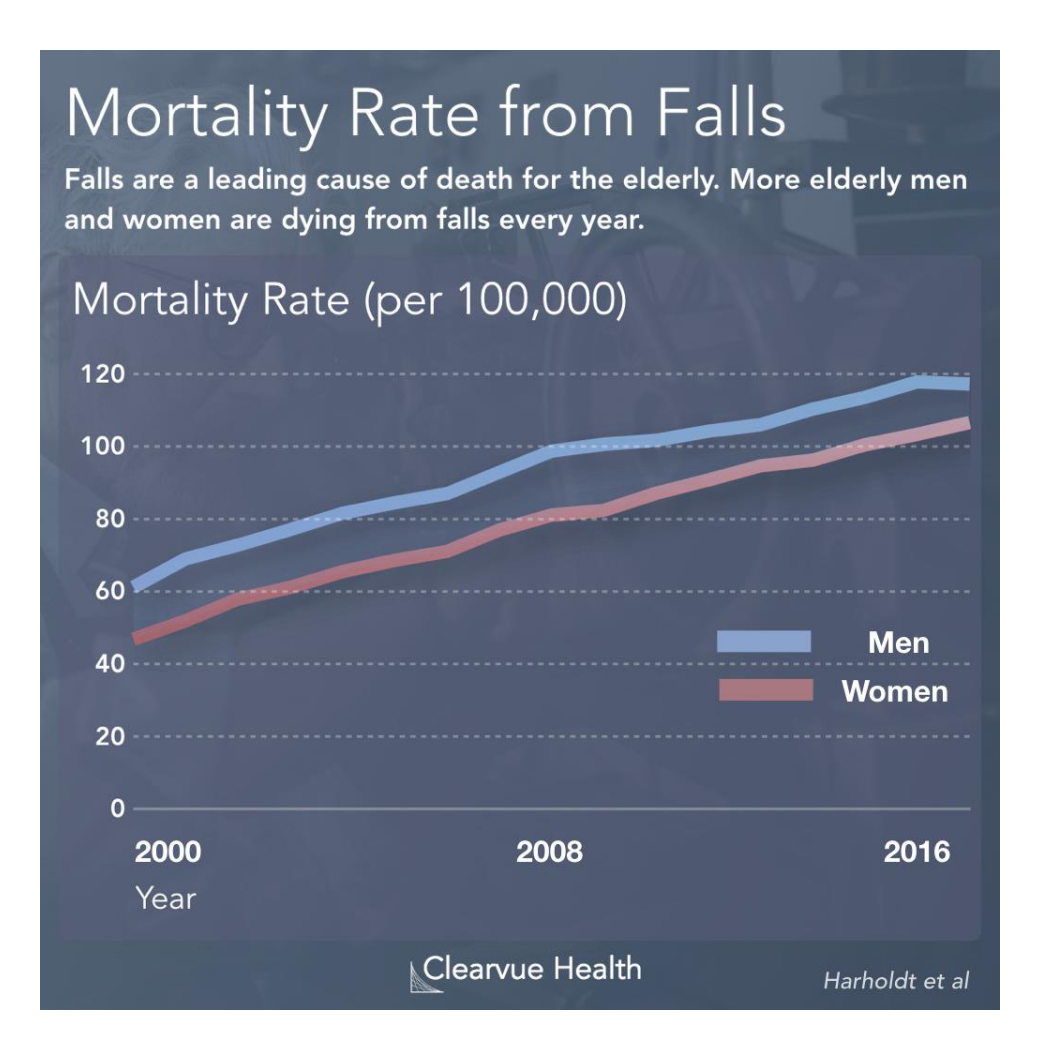
Figure 2: Increasing mortality rates for falls since 2000