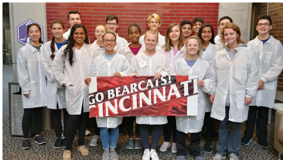
PICTURED: INNAGURAL PROGRAM STUDENTS