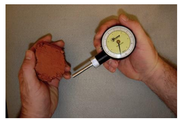
Figure 3.4.1.2. Flat face of sample ready for testing.

Zero the dial penetrometer and take a minimum of three readings on the faces of the freshly exposed interior of the clump. This is accomplished by pressing the flat face of the penetrometer cylinder against a freshly cut flat face of the soil clump, holding it perpendicular to the exposed face, and pressing slowly and steadily until the cylinder has penetrated as far as the indicator ring engraved on the cylinder. Stop pressing and read the value directly from the penetrometer dial. Record the value in tsf on the analytical worksheet. Zero the penetrometer between each reading. Record up to six values. Calculate the average of the values; round to one decimal place, and record this value.