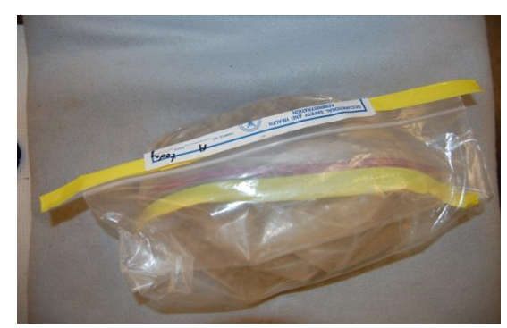
Figure 2.3. A properly packaged, sealed, and labeled excavation sample.

Submit the sample and an associated Form OSHA-91A for analysis. Request IMIS code S777 for soil analysis by OSHA Method ID-