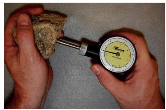
Figure 3.4.1.3. Testing with a penetrometer.