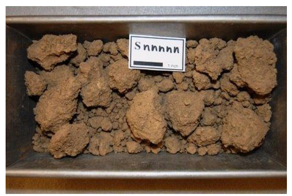
Figure 3.4.1.1. Ideal photo of an excavation sample.

Take a color photograph of the sample using a digital camera to document some of its visual characteristics. Record that the photograph was taken. Ensure the photograph is representative of the sample and that its features such as loose sand, gravel, soil clumps, and fine soil are clearly visible. Figure 3.4.1.1 shows an ideal photograph,