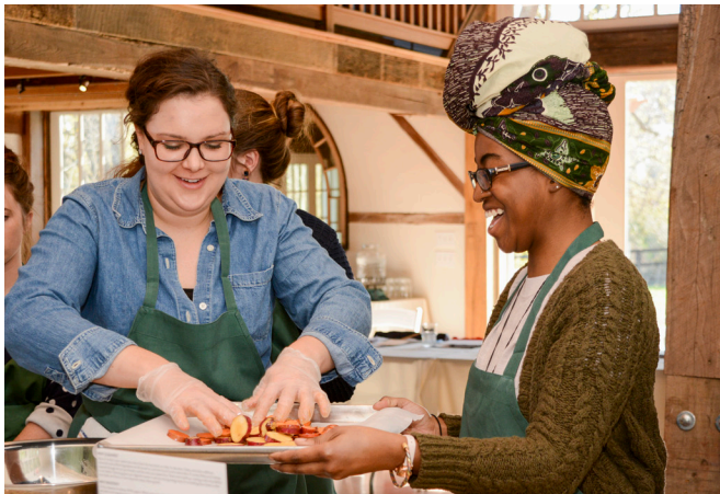
Center student wellness retreat at Turner Farm Nov. 2016

Visit www.turnerfarm.org for directions and to register